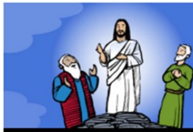
2nd Sunday of Lent, Year A

This is my own dear Son Listen to what he says!